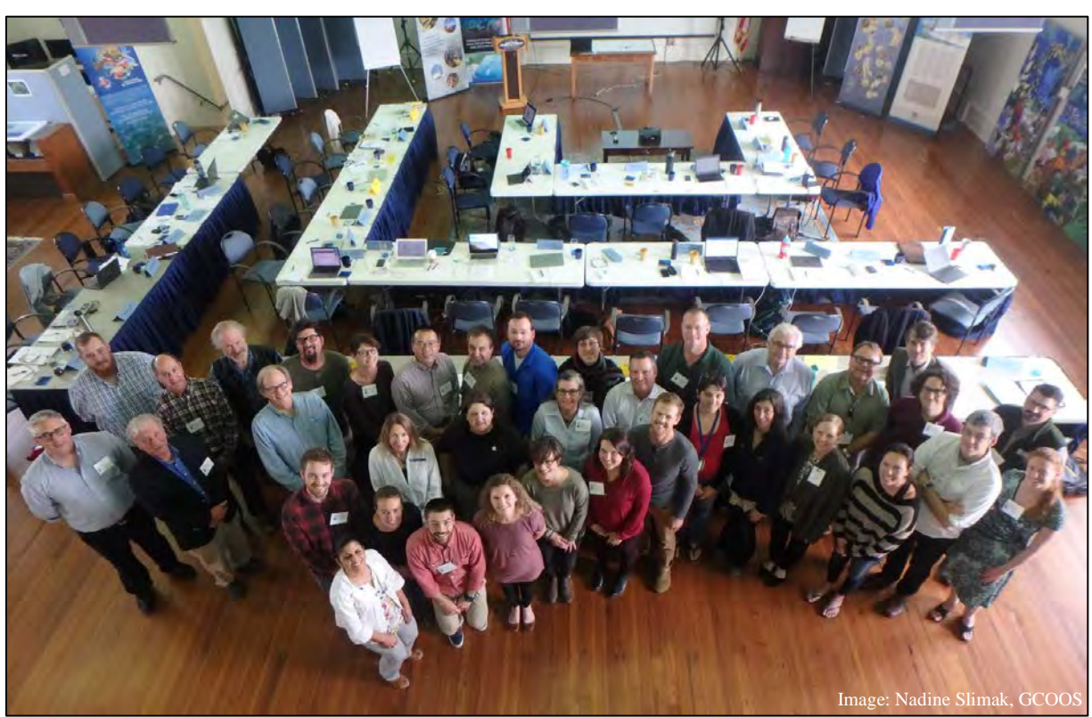
Mini-symposium participants at the Flower Garden Banks National Marine Sanctuary Office in Galveston, TX.

The Flower Garden Banks National Marine Sanctuary (FGBNMS), in partnership with the Gulf of Mexico Coastal Ocean Observing System (GCOOS) and the U.S. Integrated Ocean Observing System (IOOS), hosted a mini-symposium in Galveston, Texas on Feb. 27-28, 2018 to further investigate the localized mortality event that occurred at East Flower Garden Bank (EFGB) in July 2016. The event brought together approximately 40 key scientists and collaborators from a wide array of disciplines - all first responders to the 2016 mortality event that killed corals, sponges, crustaceans, mollusks, echinoderms, and all other invertebrates in a localized area on EFGB. Principle investigators presented their response activities, results, and hypotheses as to the causes of the event. The workshop reinforced the need for enhanced and sustained observations in and around the FGBNMS to support forecasting, mitigation and analysis of future events. This report summarizes the symposium, and numerous manuscripts are being prepared by participants. For more information, please contact Michelle.A.Johnston@noaa.gov